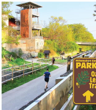
The Oak Leaf Trail meanders 118 miles through Milwaukee