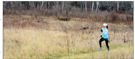
Trail running at Riveredge Nature Center

Keep in mind, spring is a seasonal transition time. Dress accordingly; wear proper clothing, especially footwear. Many of our parks and natural areas offer classes throughout the year - before heading out, consider visiting websites for special events, pet-friendly areas, classes, fees or seasonal updates. Then get out and enjoy the beauty of the trails throughout Ozaukee County. For information on all these activities and more, pick up a copy of the Ozaukee County Tourism Guide available at area chambers and visitor centers, visit www.ozaukee tourism.com and follow the Ozaukee County Tourism Facebook page. On behalf of the Ozaukee County Tourism Council, thank you for helping to make Ozaukee County a wonderful place for all to live, work and visit.