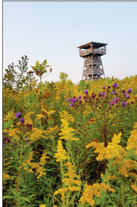
Observation tower at Mequon Nature Preserve

After a long, snowy winter, even the most casual hiker is thrilled when spring is officially on the horizon. March is a wonderful time to head outdoors, hit the trails and explore the beauty and wonderment provided by nature in Ozaukee County.