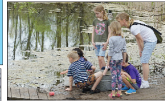
Riveredge Nature Center

Riveredge Nature Center in Saukville offers 10 miles of trails, which are open to the public year-round from dawn to dusk. Enjoy the beauty of these wonderfully restored natural sanctuaries, where you will find prairies, ponds, woods and more than a mile of Milwaukee River shoreline.